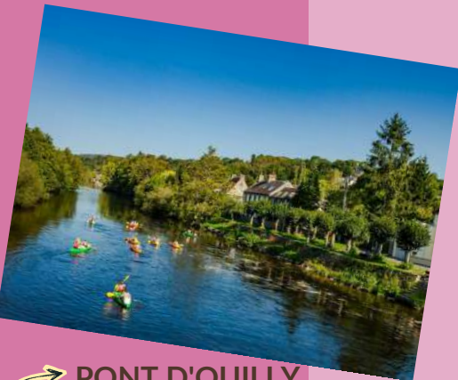
CLICK → PONT D'OUILLY