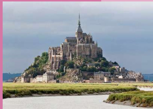
LE MONT SAINT MICHEL