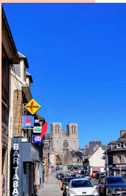
L'ÉGLISE SAINT GERMAIN