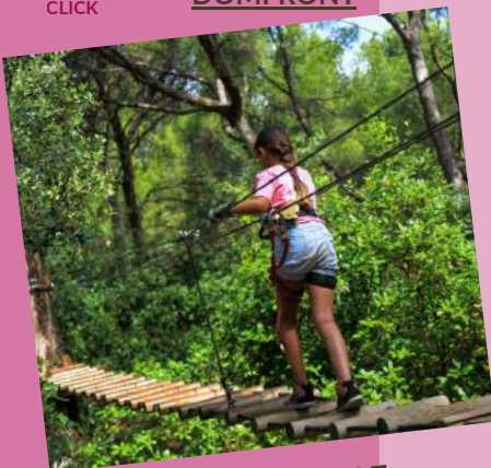
CLICK → ORNE AVENTURE