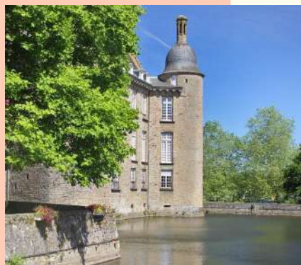
CLICK → LE CHATEAU DE FLERS