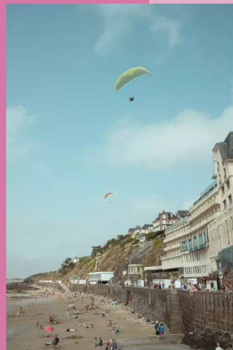
CLICK → GRANVILLE