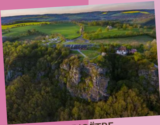
LA ROCHE D'OËTRE