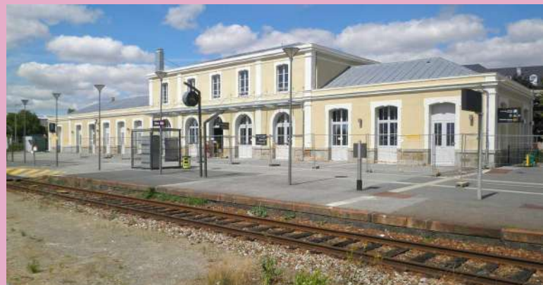
THE TRAIN STATION OF FLERS !