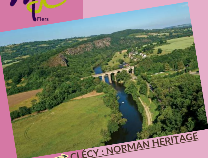
CLICK → CLÉCY : NORMAN HERITAGE