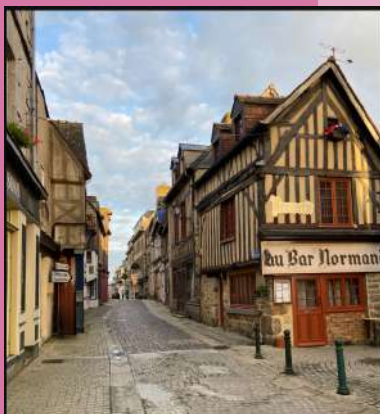
CLICK → THE MEDIEVAL CITY OF DOMFRONT