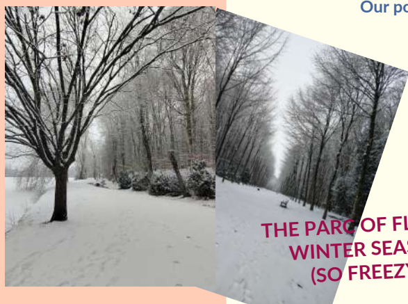
THE PARC OF FLERS IN WINTER SEASON (SO FREEZY!)

Our podcast : https://anchor.fm/mangerliebehablar